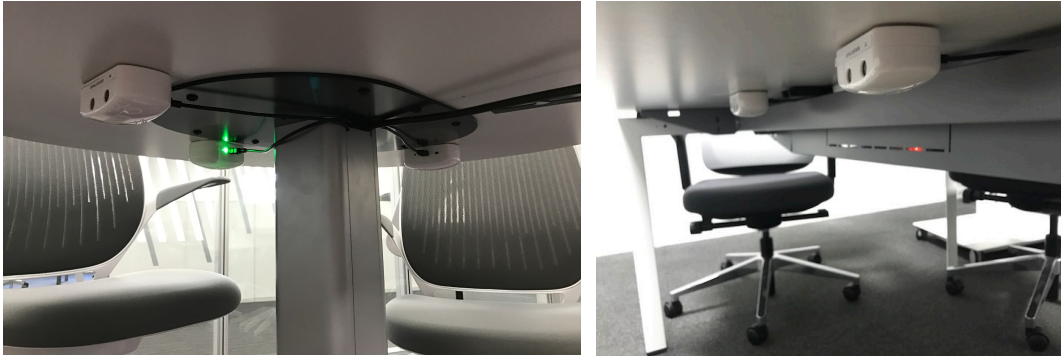
SenzoLive sensors are easy to install under any work desk or meeting table